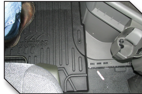
Figure 7 - Driver Mat Hook Installation

18. Pull the driver mat toward the rear of the truck to confirm that the hook is fully engaged into the mat and that the hook is adhered to the molding. If the hook is not functioning properly or the mat cannot be securely installed, do not use a Minimizer floor mat on the driver side of the vehicle.