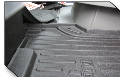
Figure 9 - Passenger Mat Retention Hook Location

23. Prior to operating the vehicle, read the Safety Instructions for Vehicle Operation.