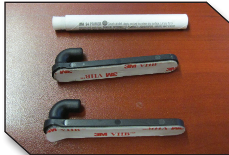
Figure 5 - Retention Hook and Primer 94

8. Insert one hook through the hole at the right edge of the driver mat. The hook should fit flush with the underside of the driver mat.