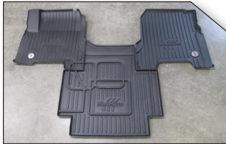
Figure 1 - Floor Mat Kit #104245

• Contents of floor mat kit # 104246 are shown below in Figure 2.