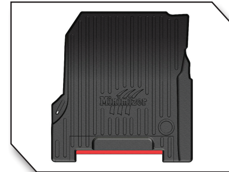
Figure 8 - Passenger Mat Trimming Diagram

22. Install the passenger mat retention hook as shown in Figure 9. Repeat steps 9-16 above to properly attach the hook to the plastic molding near the floor of the truck.