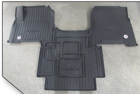
Figure 2 - Floor Mat Kit #104246

• Contents of floor mat kit # 104246 are shown below in Figure 2.