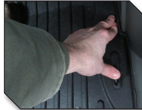
Figure 6 - Apply Pressure to Hook

17. For optimal adhesion do not disturb the hook for a period of 20 minutes after installation. Figure 7 below shows the properly installed driver mat and hook.